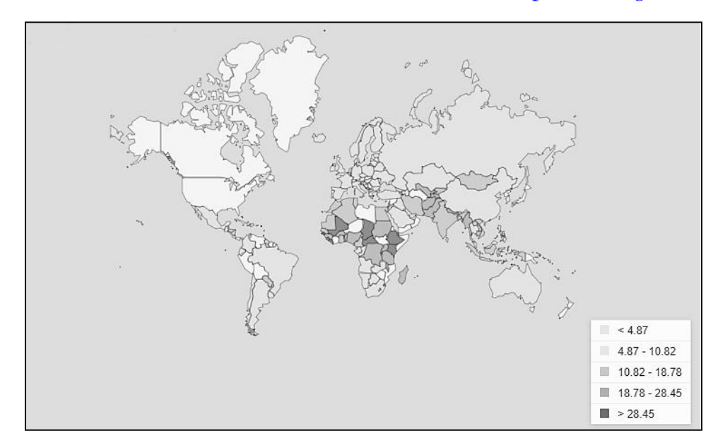
Fig. 2: Agriculture, value added in 2020 (% GDP) (World Bank, 2020).

REVISTA DE LA UNIVERSIDAD DEL ZULIA. 3ª época. Año 14, N° 39, 2023 Reynier Israel Ramírez Molina et al/// Innovative Strategies in agricultural production... 119-138 DOI: http://dx.doi.org/10.46925//rdluz.39.07