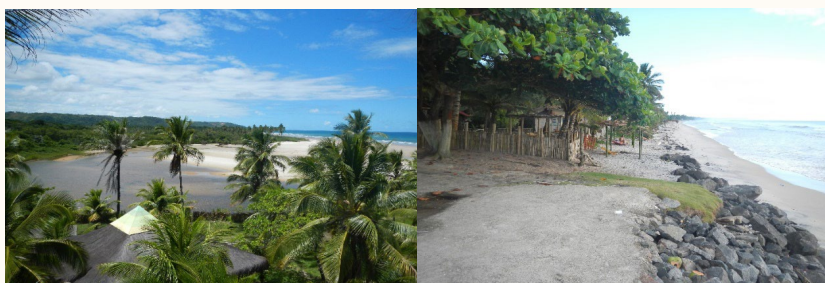
Figure 4. Field observations in Ilhéus, state of Bahia: A) Overview of the mouth of the Sargi River at the border between the municipalities of Ilhéus and Uruçuca from the Ponta do Ramo Beach; B) High vulnerability to coastal erosion, São Domingos Beach (sector 2).