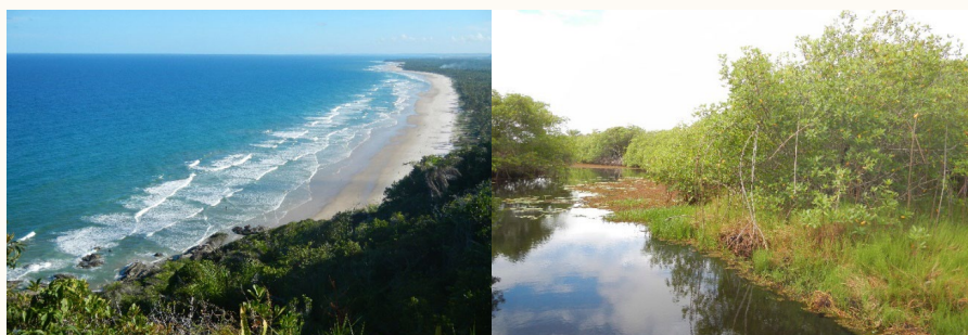
Figure 2. Examples of coastal ecosystems found along the northern shoreline of the municipality of Ilhéus, state of Bahia, Brazil.

Though this new transportation enterprise is thought to improve the economy in the region, there is much concern regarding the possible impacts of this complex to the socio-environmental dynamics of the area. This coastal area, known as the Cacao Coast, presents various ecosystems of high environmental sensitivity. Sandy beaches, mangrove forests, wetlands and restinga vegetation are found along the shoreline with different levels of preservation (Figure 2).