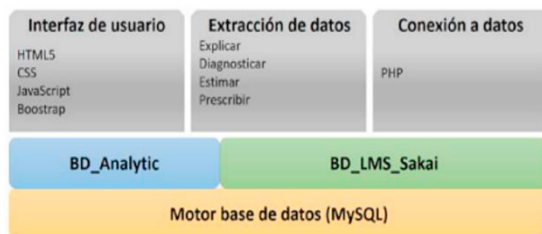
Figure 1. System design model.

In order to define the design of the final model, we took the Learning Analytics model worked by [14] as a basis, and from which some characteristics were taken (Figure 1).